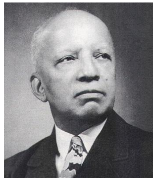
Carter G. Woodson

Black History Month was established in 1976 by Afro-Americans for the Study of Afro-American Life and History .